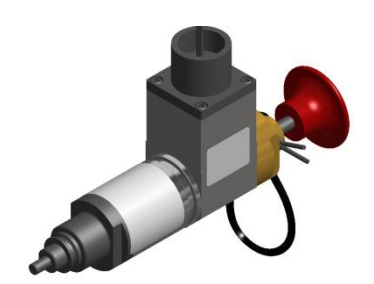
Item No. 1